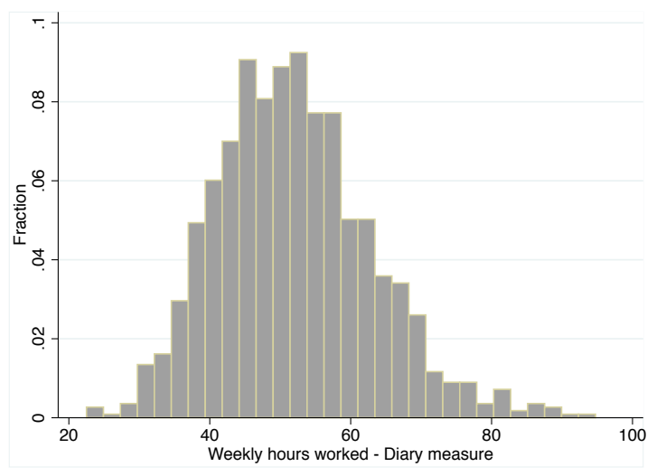
Figure 1: CEO weekly hours worked, diary measure

Notes: The graph shows the histogram of total weekly hours worked (built from actual diary data) by a sample of 1114 CEOs.